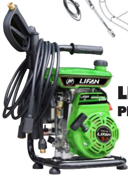
LFQ-2130 PRESSURE WASHER